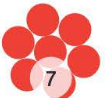
Links to existing resources