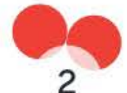
Other, specify in chat